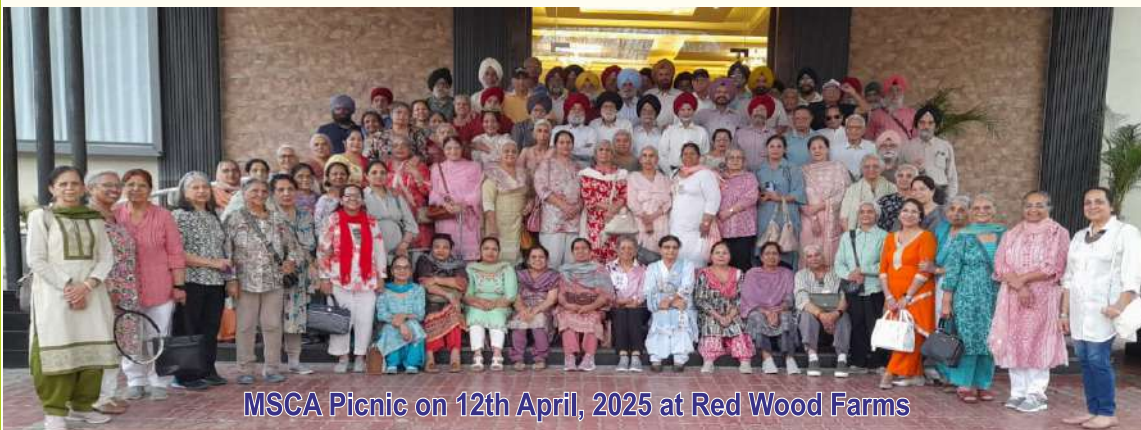
MSCA Picnic on 12th April, 2025 at Red Wood Farms

MOHALI SENIOR CITIZENS' ASSOCIATION MOHALI